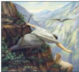
1st Reconciliation (Penance)