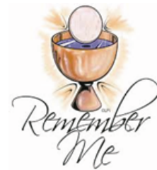
1st Eucharist (Holy Communion)

Preparation began in January and continues into Lent in which 1 st Reconciliation will be made and will be completed on Easter Sunday as they receive 1 st Eucharist.